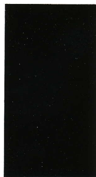
*STEALTH BLACK TSR = .26