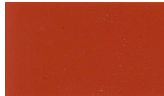
*BARN RED TSR = .35