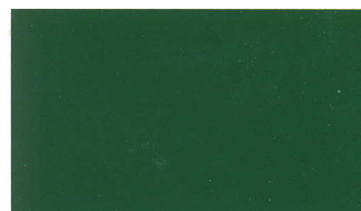
*EMERALD GREEN TSR = .33