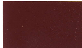
*BURGUNDY TSR = .26