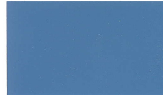
*HAWAIIAN BLUE TSR = .33